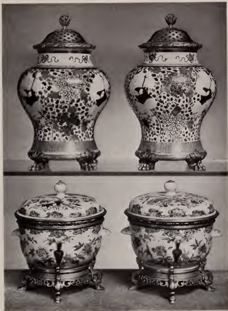
[TOP: NUMBER 323; BELOW: NUMBER 324]