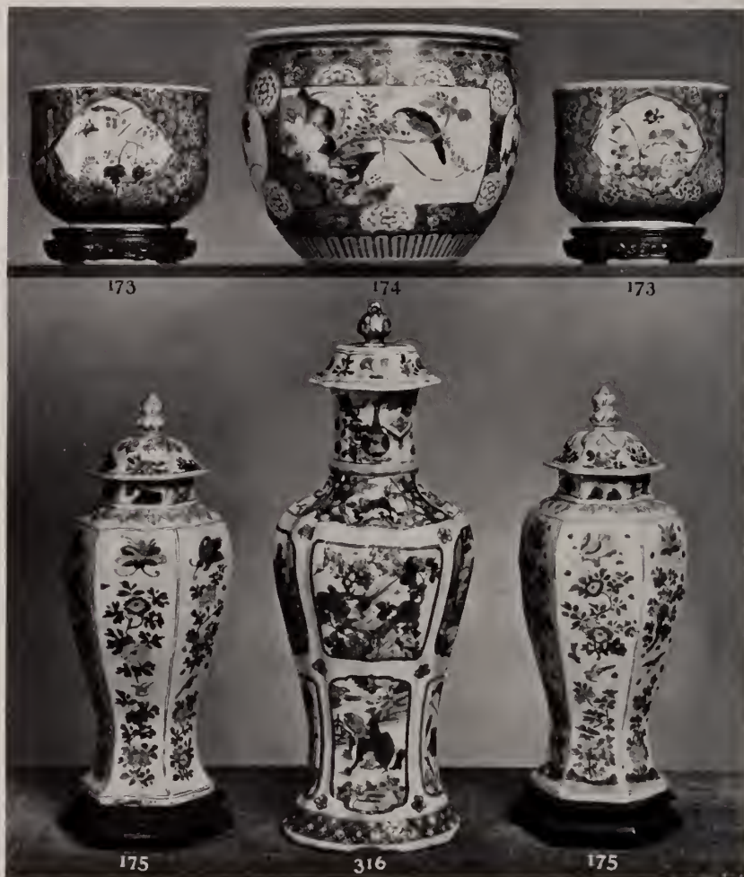
[NUMBERS 173-5 AND 316]