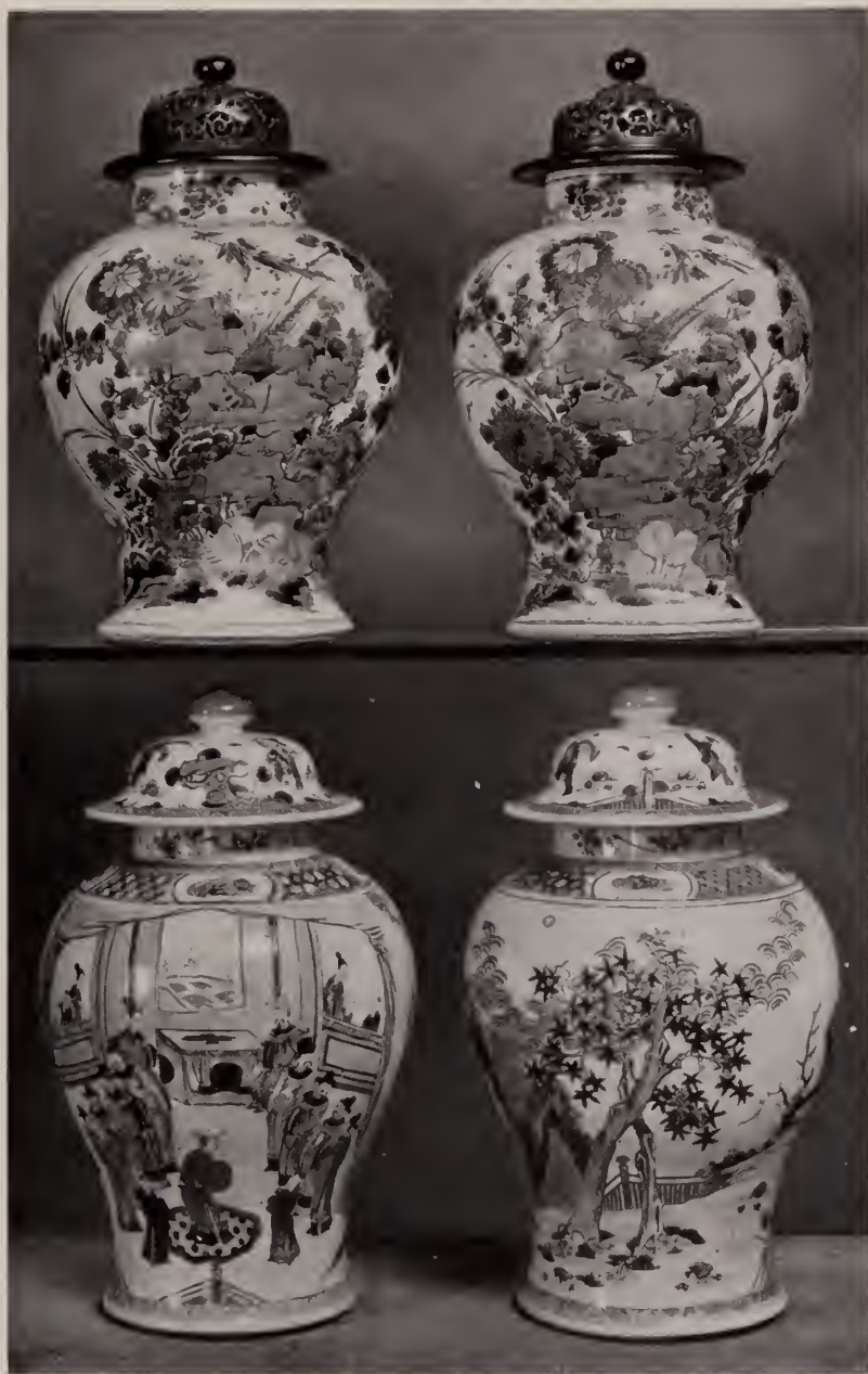
[TOP: NUMBER 340; BELOW: NUMBER 339]